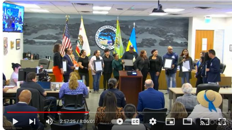
Board of Supervisors 8.22.23